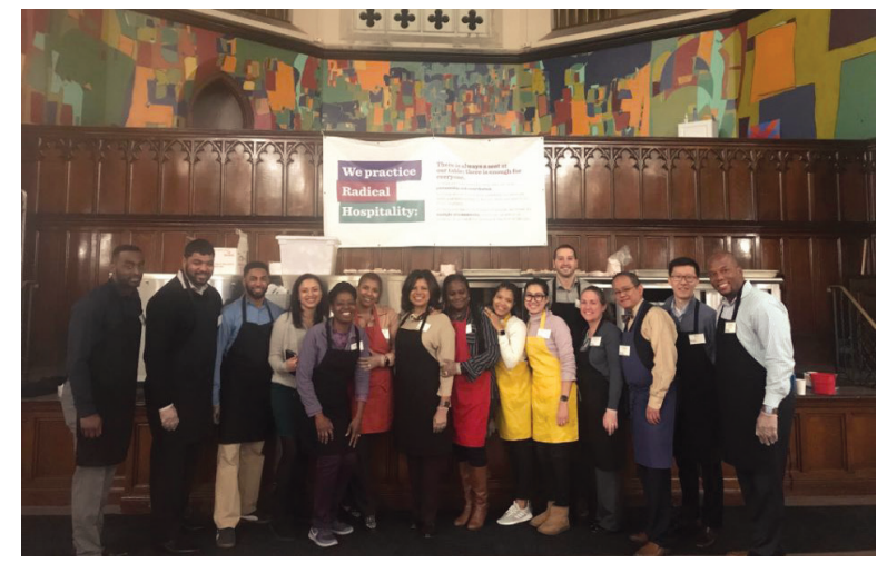
LUNCH WITH A SIDE OF HUMILITY: Xponance is a big backer of Philadelphia's Broad Street Ministry. Each quarter, team members feel privileged to serve lunch to the less fortunate in the city.

Zoom, which include the CEO and the president/COO. Team members have played Uno and Trivial Pursuit together virtually. They've also come together for a virtual cooking lesson.